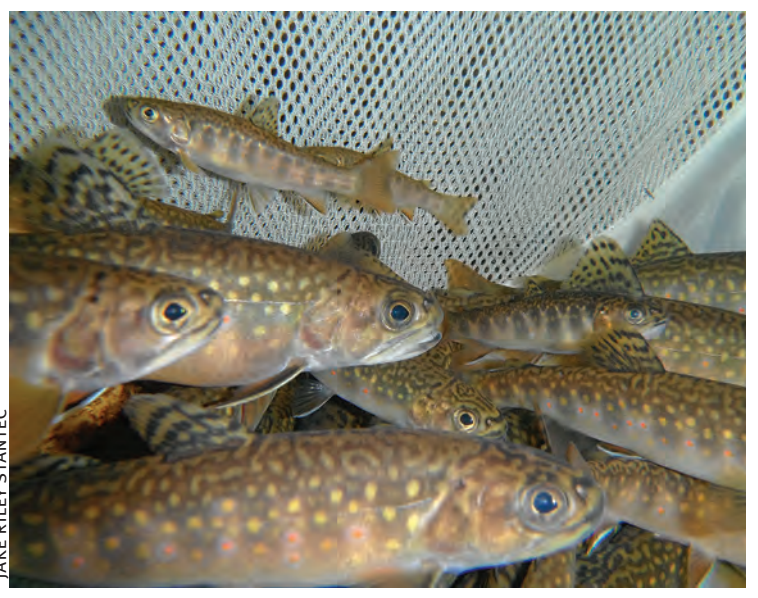
Brook trout in net

This August's survey had a mild glitch with one day having to be rescheduled because of rain, which resulted in fewer volunteers. Fortunately, the Forest Service was able to wrangle additional helpers. Huge thanks to all who participated.