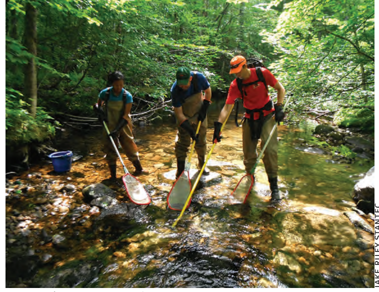
Nets ready, surveyors await trout

The waters were relatively high, but the overall Brook Trout numbers were down, especially for young-of-the-year fish. This can most likely be attributed to a major storm last October, which would have flushed out many of last fall's freshly spawned eggs. Numbers of fish in the three- to six-inch range were also slightly down. But as Mark Prout, Fisheries Biologist from the Forest Service stated, "despite the drought, floods, and heat of the last three years, all age classes are still present at all sites." This is good news.