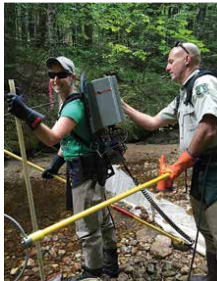
Suiting up for the electrofishing survey

glance, these numbers are very good compared to previous years, with higher numbers only occurring twice: in 1995 and 2009. It will be interesting to compare 2016 weights with those earlier years. This was a very positive project for many reasons. We added to the existing data set of Brook Trout populations in the upper part of the watershed, which will be useful as we look toward potential impacts on that fishery from climate change, Albany South, and other habitat alterations. It was a great chance to