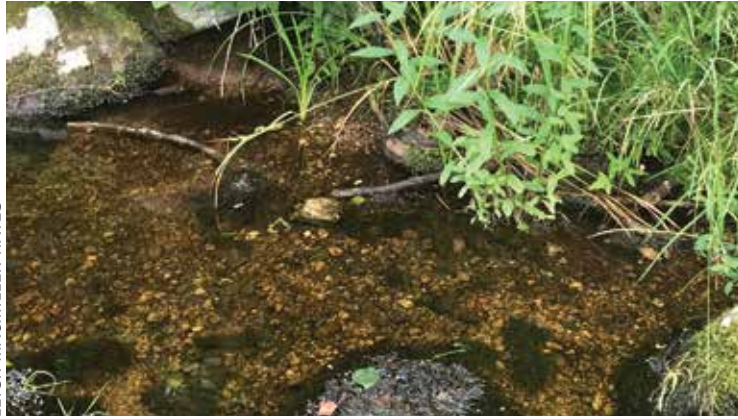
LEIGH MACMILLEN HAYES

Under the heading "A Comprehensive Health Plan for the Kezar Lake Watershed," we will be able fund a research project as