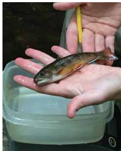
Native Brook Trout!

involve community members in an exciting and important project. And the Survey provided an excellent opportunity to collaborate positively with the FS. Because of this year's success and KLWA's clear commitment to and care of the watershed, along with our capacity to provide volunteers, the FS plans to put this on their schedule for next year. Given that it's best to collect three years of data to account for inter-annual variability in native Brook Trout populations, this is great news! ♡