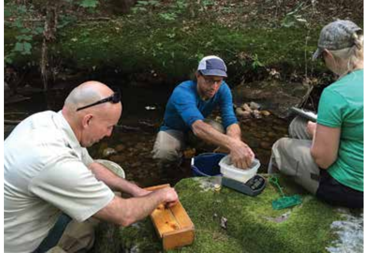
Measuring and weighing the captured fish

With this summer's drought conditions, the waters were extremely low and we honestly thought that we'd catch very few fish. It was a big surprise, therefore, when we caught over 550 fish between the four sites, with sizes ranging from two to seven